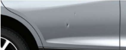
4 or more dings per panel