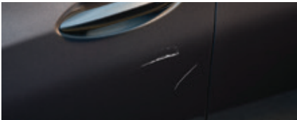
1 dent (more than 4") or 1 scratch (equal to or more than 6") per panel