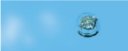
Cracked glass (equal to or more than 1/2" in diameter) or spider cracks