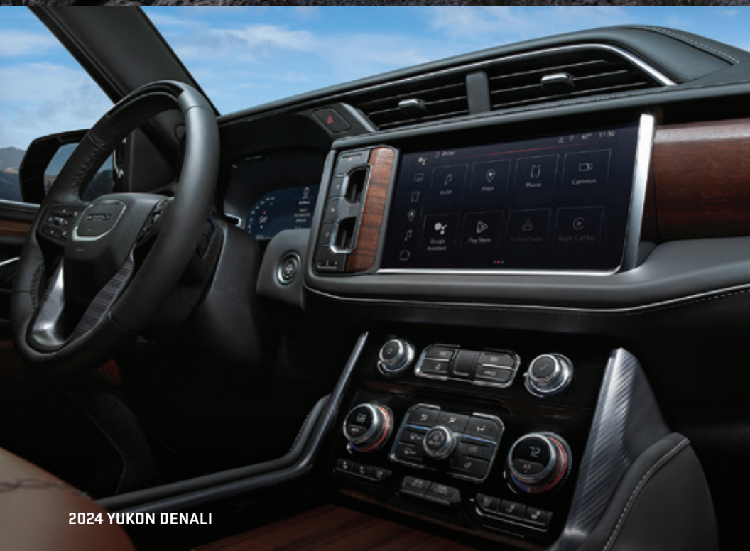
2024 YUKON DENALI