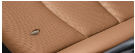
Upholstery holes more than 1/8"